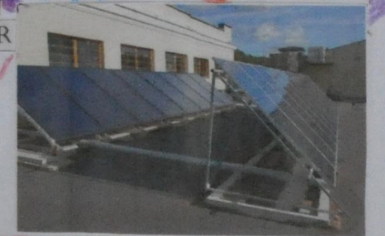
SOLAR BATTERIES ON THE ROOF OF YĻAKIAI GYMNASIUM