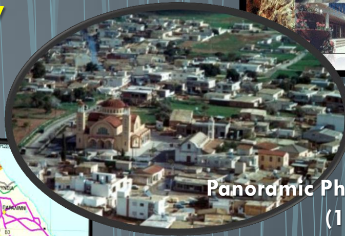
Municipality of Paralimni