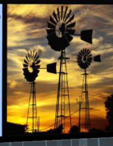
Municipality of Ayia Napa